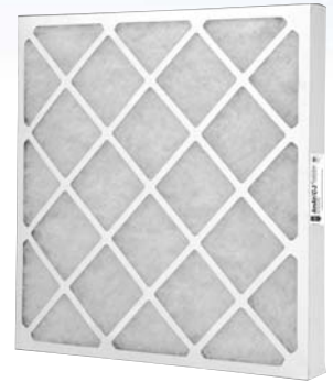
AmAir®/C-3 carbon panel filter

AmAir/CP-3 media pads consist of a 1" thick substrate impregnated with 300 grams of carbon per square foot contained in a fine mesh netting to prevent spilling. Use AmAir/CP-3 pads in combination with particulate filters to add odor removal capability to any filtration system. The carbon pads can be changed independently from other air filters to maximize the service life of each product.