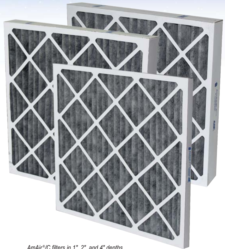
AmAir®/C filters in 1", 2", and 4" depths

Greater gas-phase media density solves your odor problems by removing odor concentrations and providing protection over a longer period of time. The true test of a gas-phase filter is how long it will continue to remove objectionable odors and other gaseous contaminants. AmAir/C, AmAir/C+SAAFoxi, AmAir/SAAFoxi, and AmAir/CP filters deliver fresh air longer.